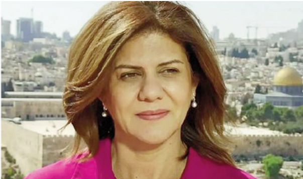
Shireen Abu Akleh, 1971-2022