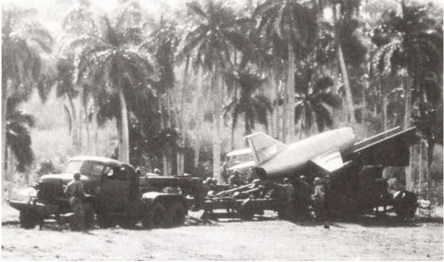
▲ Nuclear-armed FKR Cruise Missile in Cuba in October 1962. These missiles were not detected by US intelligence.

thought this was a conventional facility. The intelligence analysts also failed to correctly identify the two central stores where most of the nuclear weapons were held. In summary, US military planners grossly underestimated the number of nuclear weapons on the island, particularly the tactical nuclear weapons.